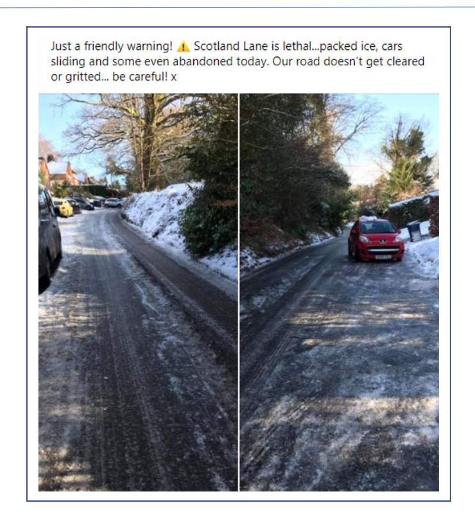
Figure 4 – Winter conditions as witnessed on social media in real time

7.32. It is noted that Surrey County Council Highways department has requested a delay in consideration of the application pending further work being done to ascertain the transport and highways implications of the proposed development and the extent to which concerns can be allayed, if at all.