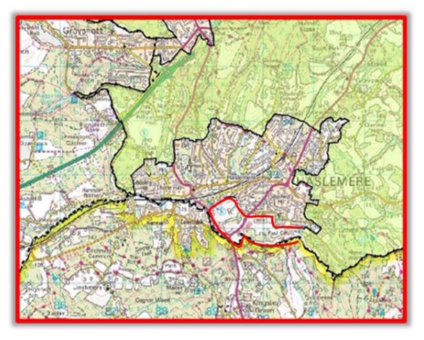
Figure 3 – Before and after threatened developments at 'Scotland Park' and Sturt Farm – Loss of AONB & AGLV land and resulting Coalescence